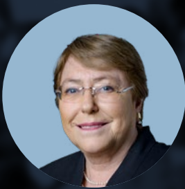
Michelle Bachelet, UN High Commissioner for Human Rights

“ When human rights defenders are afraid to question reports about wrongdoing and deficits they observe, it affects the entire society. Strategic lawsuits against public participation (SLAPPs) have exactly that effect: they can impose sometimes significant fines and criminal sanctions, and thus intimidate human rights defenders and stop them from shedding light on critical issues. It is our shared responsibility to prevent SLAPPs from undermining everyone’s right to know. ”